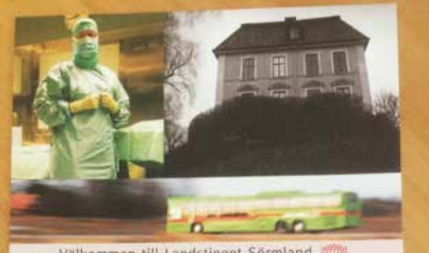
Välkommen till Landstinget Sörmland

The County Council was established in 1862 by a national law, which made it possible to establish self-government. The County Council is now, in 2017, preparing for a new form of organisation together with two other authorities in Sörmland, to become the "Region of Sörmland".